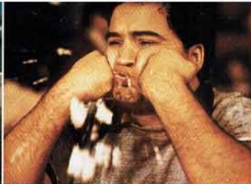
'National Lampoon's Animal House'