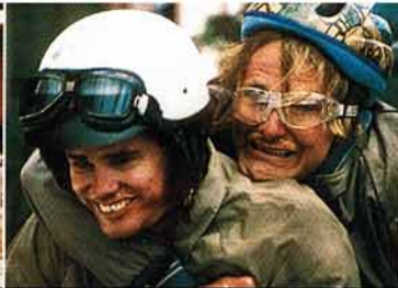
'Dumb and Dumber'