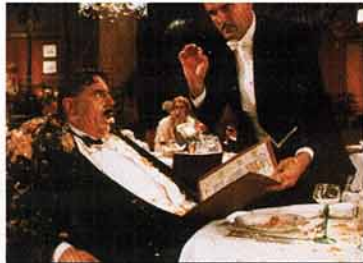
'Monty Python's The Meaning of Life'